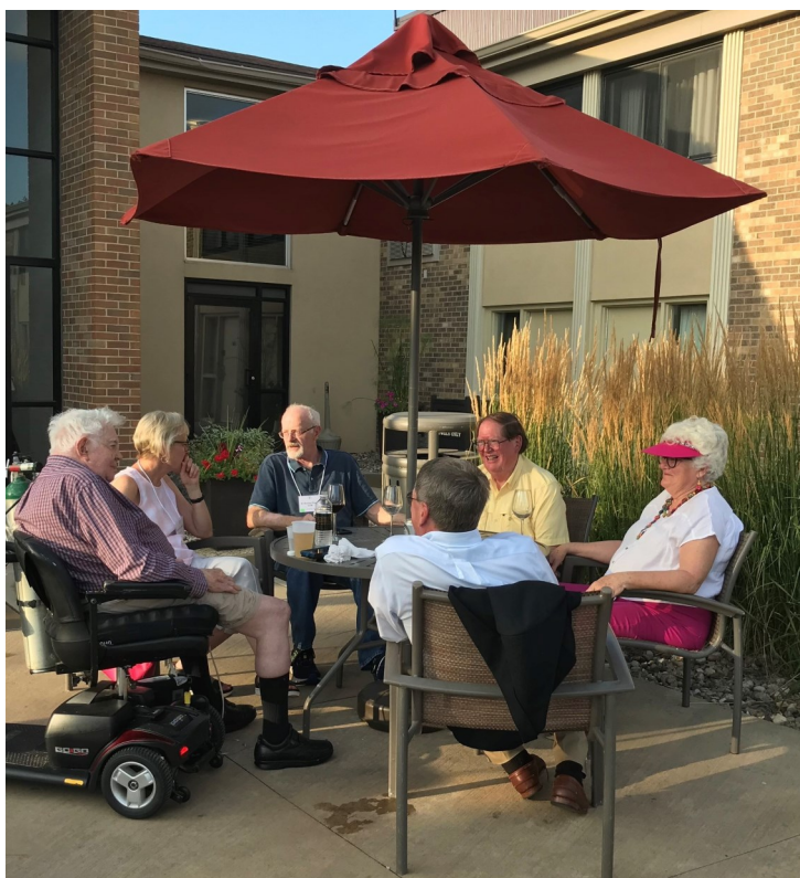
Annual Meeting attendees enjoy the beautiful weather at the poolside welcome social on Sunday, August 11th.

PRST STD US Postage PAID Permit No. 12 Brookings, SD